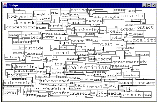
Figure 3: The MAESTRO Fridge

query MAESTRO from Washington D.C. over the telephone via the speech recognition agent that may reside remotely on a computer at SRI in Menlo Park, California. At the same time, the MAESTRO User Interface (Figure 1) can reside in Washington D.C. on a laptop computer for local display. In the future, it is expected that OAA's capabilities will help provide automated synergy of multimedia analysis technologies, inferring across multiple on-line processing streams.